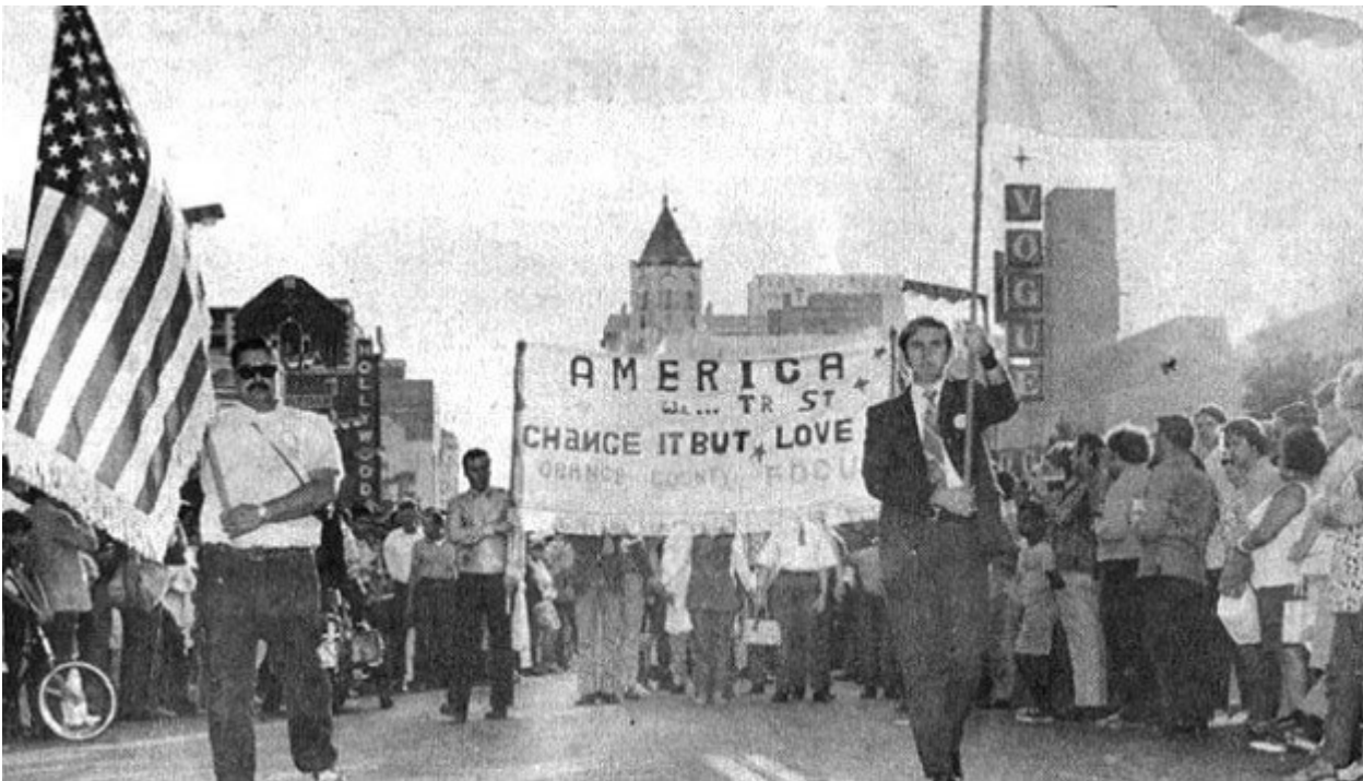
Gay Pride Parade, Los Angeles, 1970