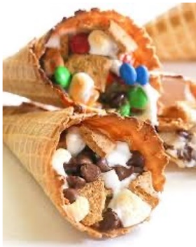
The Girl Who Ate Everything