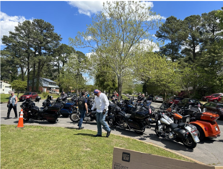
Tidewater HOG Attends Poplar Hall Community Day