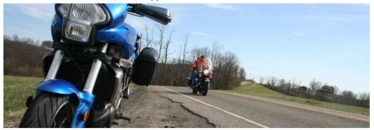
As soon as the weather breaks, everyone wants to get out for a ride. Just make sure you're ready.

What can we do? Realize that this hazard is at its peak this time of year. Be extra alert at intersections and other danger spots. Choose a lane position that optimizes the space between us and threats. Always be thinking about an escape route or a plan of action if the worst-case scenario begins to unfold. And finally, follow that old piece of advice: Ride as if you're invisible. Because to some inattentive drivers, essentially you are invisible.